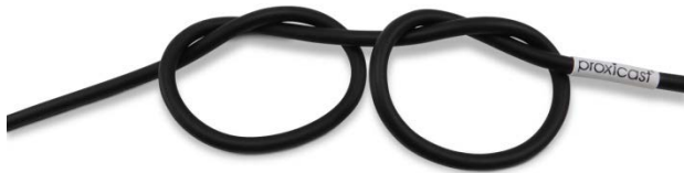
Proxicast HDF UltraFlex-240