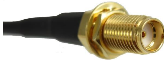
SMA Female Bulkhead Jack