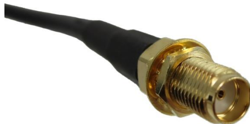
SMA Female Bulkhead Jack